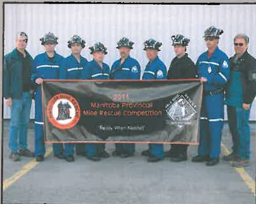
Hudson Bay Mining & Smelting Co. Limited – Flin Flon