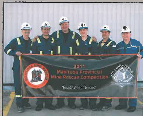
Hudson Bay Mining & Smelting Co. Limited – Snow Lake