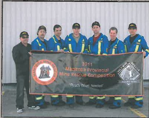
San Gold Corporation