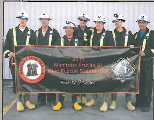
CaNickel Mining Ltd (formerly Crowflight Ltd)