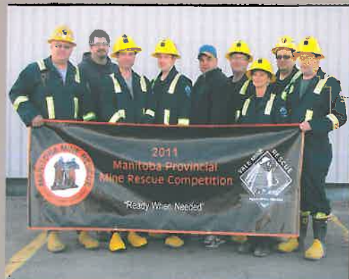
Tantalum Mining Corporation of Canada Ltd