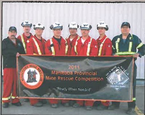
Vale - Manitoba Division