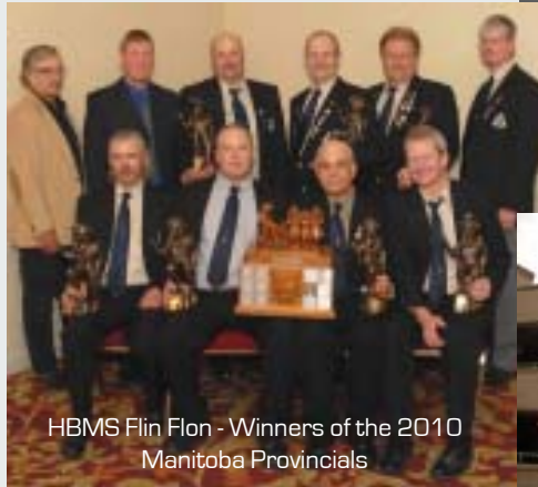
HBMS Flin Flon - Winners of the 2010 Manitoba Provincials

Hosted by SanGold Corporation, the 2010 Provincial Manitoba Mine Rescue Competition was held in the Union Centre parkade in Winnipeg, MB., on May 27, 2010.