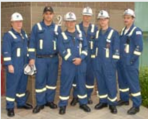
Hudson Bay Mining & Smelting Co. Limited — Snow Lake