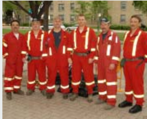
Vale - Manitoba Division