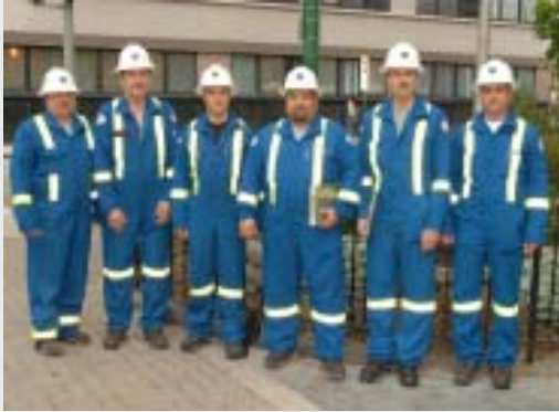
Atomic Energy of Canada Ltd. — URL