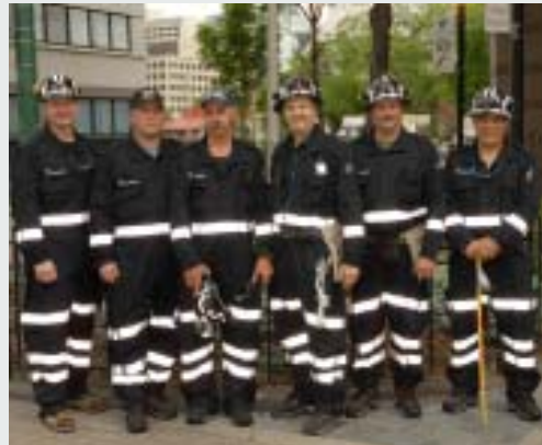
Hudson Bay Mining & Smelting Co. Limited — Flin Flon