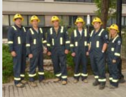
Tantalum Mining Corporation of Canada Ltd.