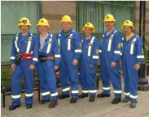
San Gold Corporation