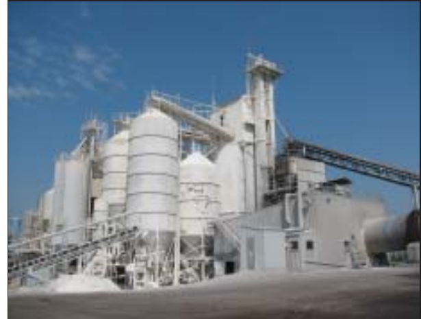
Graymont Western Canada, Faulkner, MB June 2010.

Manitoba achieved a .06 time loss accident rate in 2009.