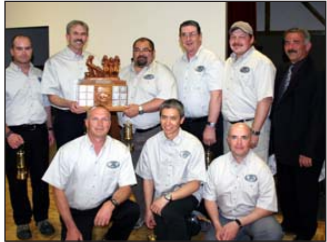
Atomic Energy of Canada Ltd. (AECL-URL) 2009 Provincial Mine Rescue Champions.

The mine rescue teams' first challenge was to extinguish an equipment fire. Next they traveled the mine ramp system on foot through a series of tunnels that became progressively smaller as they proceeded. At the final tunnel, teams had to remove their breathing apparatus in order to pass through; prior to taking off their apparatus they tested the air to determine it was safe to breathe. The rescuing of miners in a refuge station proved to be demanding as they were both stretcher victims and had to be moved back through the confined passageways and ultimately to safety on surface.