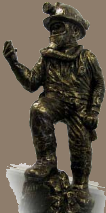
Manitoba Provincial Mine Rescue Competition Winner's Trophy